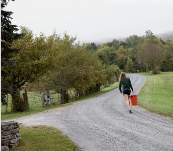
Carrying apples to the pasture to feed the cows on Mountain Valley's campus.