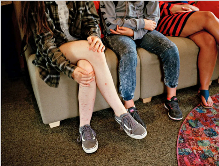
Kids hanging out in the lounge after lunch at Mountain Valley.