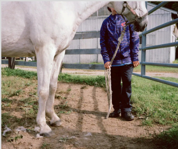
A resident taking part in equine therapy at Mountain Valley.