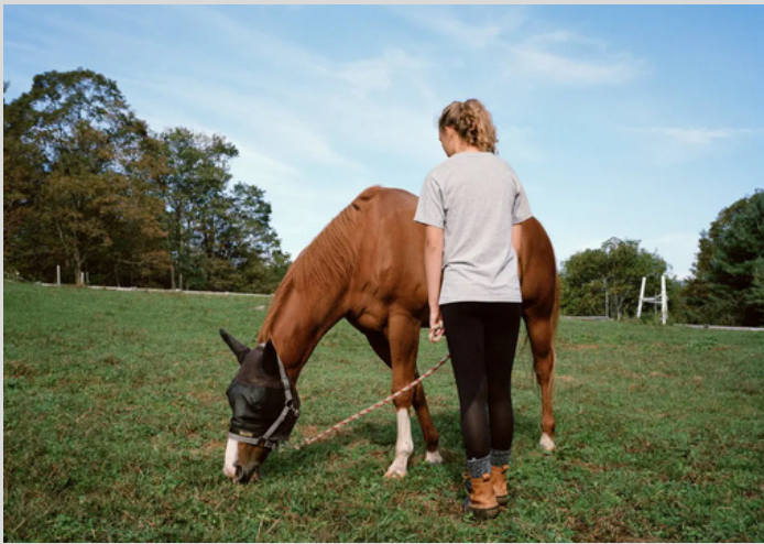
A Mountain Valley teenager during equine therapy.