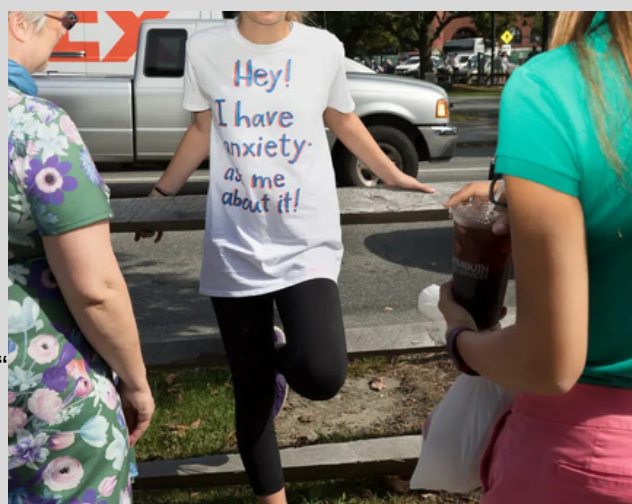
A Mountain Valley teenager talking to a passer-by during exposure therapy.

“O.K., I’m going to go mingle,” she announced.