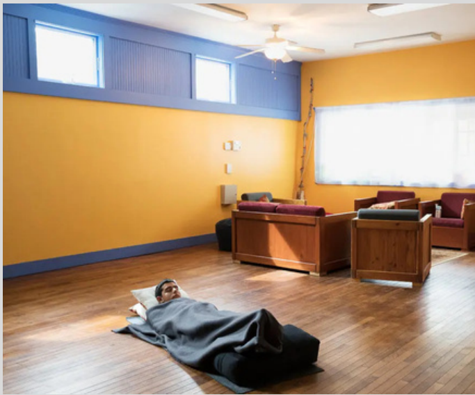
A resident meditating during a yoga session at Mountain Valley.

In his case, he had little doubt that social media made him more self-conscious. “In high school, I’d constantly be judging my self-worth online,” he told me, recalling his tortured relationship with Facebook. “I would think, Oh, people don’t want to see me on their timeline.”