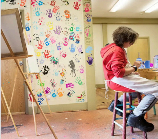
A Mountain Valley resident doing art therapy.

Some schools have taken drastic measures to accommodate what one administrator called “our more fragile students.” At Roxbury High School in Roxbury Township, N.J., there are two dedicated classrooms for anxious teenagers, including one next to a mural of Edvard Munch’s painting “The Scream.” These students typically avoid the mammoth school cafeteria in favor of eating lunch in one of the classrooms, as they did on the day of my visit last May. They had just finished gym class, an anxiety-producing event for some even as the school did all it could to reimagine the concept. Music blasted throughout the gym as the teenagers halfheartedly played something vaguely approximating a game of volleyball. The ball was allowed to bounce once before being struck — not that anyone was keeping score.